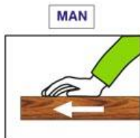
MANUAL FEED MOTION TOOLS