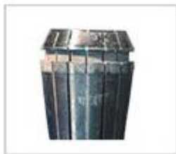
Collet too dirty