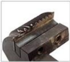
Damaged body of tool

Install only tools in perfect sharpening conditions on the machine. Never use cracked, deformed, chipped, or poorly sharpened tools.